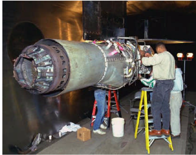
Back end of installation showing the nozzle leaves of the J85 Engine.

conducted over a range of supersonic Mach numbers as well as at some subsonic flow conditions.