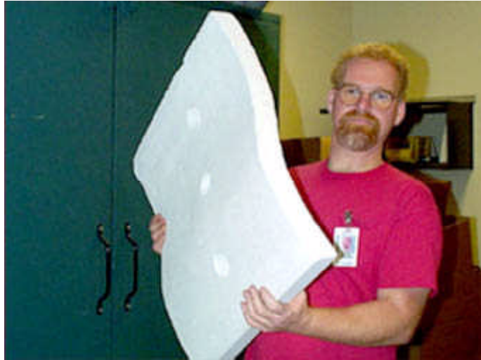
2- by 2-ft AETB panel with complex curvature manufactured by the vacuum-assisted forming process.

The vacuum-assisted forming process starts with the fabrication of a permeable forming tool, or mold, with the proper part contour. This reusable tool is mounted over an internal rib support structure, as depicted in the diagram, such that a vacuum can be pulled on the bottom portion of the tool. AETB slurry is then poured over and around the tool, liquid is drawn from the slurry, and the part forms over the tool surface. The part is then dried, fired, and finished machined. Future plans include an evaluation of the need for additional coatings and surface-toughness treatments to extend the durability and performance of this material.