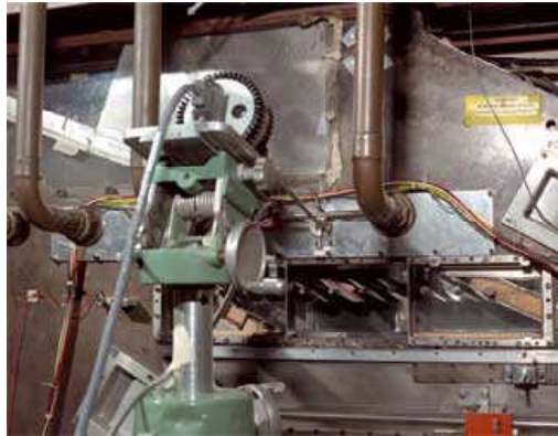
Borescope imaging system being used to gain a full perpendicular view to the painted blade surface in a Glenn research rig.

are typical of fiber-optic type borescopes. This produces images of much higher clarity and uniformity, which are critical for acquiring accurate measurements from the luminescent coatings.