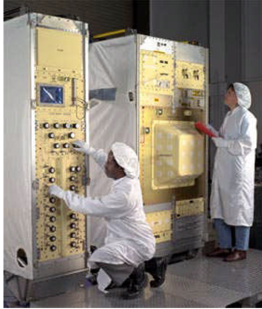
Combustion Module-2 flight system in SPACEHAB racks.

To accommodate just LSP-2 and SOFBALL-2, the CM-2 team needed to convert the facility from Spacelab to SPACEHAB and to conduct an extensive refurbishment and requalification for flight safety and science needs. The SPACEHAB conversion impacted every engineering interface including physical layout, structures (dynamics and stress), and thermal, electrical, data, software, and safety controls. For example, given the higher launch loads and the fact that CM-1 was qualified for only one flight, a special structural qualification approach was developed using a combination of low-level rack system vibration testing and analysis to minimize the risk to the CM-2 hardware. As in CM-1, flight rack integration was accomplished at Glenn, saving time and risk for the conversion process. The final flight assembly is shown in this photograph. Internal to CM-2, there was also a significant effort including extensive pressure system refurbishment and retesting as well as upgrades and/or fixes to most diagnostics based on CM-1 experience. For example, six of the seven CM-2 cameras were modified in some way to improve performance. The schematic shows the core of CM-2, the experiment package, with the Mist experiment diagnostics highlighted.