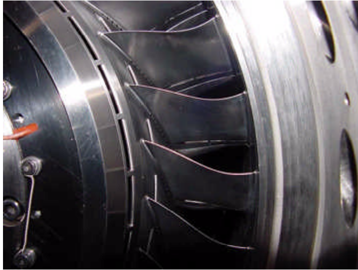
Aspirated stator with bleed slots on blade surfaces, bleed holes along the stator hub, and pitchwise bleed slot between blades.

passages to be machined into each half before assembly.