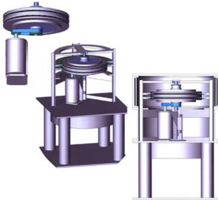
Assembly of blade tip fan drive rig.

The goal of the test program is to maximize both the armature speed and the stator current density, thus producing a very high power density motor. The unique feature of the rig is that a generator provides the electrical current and voltage to drive the motor. The test motor and an auxiliary motor provide the torque to drive the generator. The auxiliary motor will also control the speed of the test rig. Later a pulse-width-modulated motor drive will be developed to drive the motor, and the torque will be absorbed by the generator.