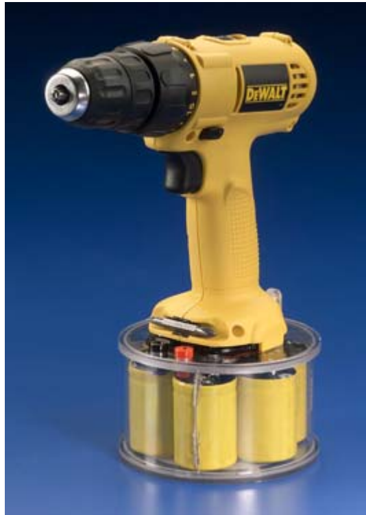
Cordless drill powered by ultracapacitors.

A typical cordless drill is powered by batteries. The batteries provide reduced performance over time, and eventually they need to be replaced and disposed of. Because batteries are not environmentally friendly, they must be disposed of carefully, and they have a memory that limits the energy that they provide to what was used previously. In contrast, the HPM cordless drill was recharged in 1 min and provided 3 min of continuous operation, or enough power to drive about 30 wood screws. The ultracapacitors provided consistent performance and worked well at low temperatures. In addition, they have no memory and will never need to be replaced.