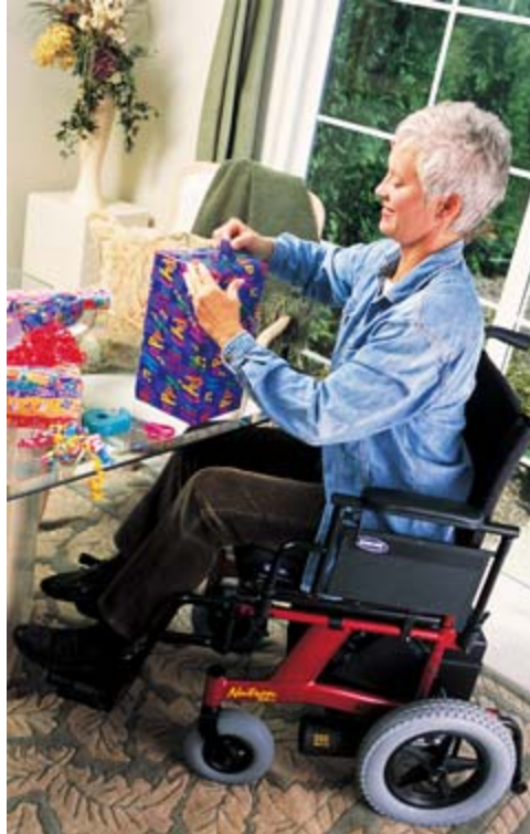
Electric wheelchair powered by ultracapacitors.

A two-wheeled human transportation system also is being evaluated. This vehicle is usually equipped with batteries that take 6 hr to recharge and must be replaced annually under normal use. For HPM, the vehicle is being equipped with maintenance-free ultracapacitors that have unlimited life and can be charged in minutes.