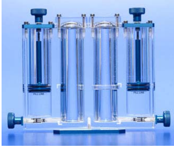
Contact Line unit 2. CL-2 flight unit showing pinning edge in right-center fluid chamber.

Long description of figure. The unit is made of a single block of Plexiglas (polymethylmethacrylate, or PMMA). Within the unit are two reservoirs that each feed the two fluid test cylinders by a turning knob-driven piston. The test cylinders are geometrically identical with the important exception that the left cylinder is completely smooth whereas the right cylinder has a pinning edge, approximately one-third of the distance above the base. In addition, above the contact line in the right fluid cylinder, a nonwetting film is deposited on the inner surface to allow the fluid to return to the pinned condition between experimental runs.