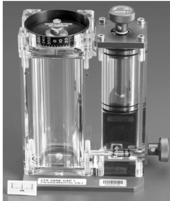
Vane Gap unit 1. VG-1 and VG-2 are nearly identical, but VG-2 has a coating along the interior surfaces that changes the wetting characteristics of the fluid. VG-2 also has a slightly thicker vane than VG-1. This changes the interaction of the fluid with the vane and the side wall.

CFE is a NASA Glenn Research Center experiment developed under contract by ZIN Technologies, Inc. Three experiments constitute CFE--the Interior Corner Flow (ICF), the Vane Gap (VG), and the Contact Line (CL) experiments; and each experiment has two unique experimental units. All units use similar fluid-injection hardware, have simple and similarly sized test chambers, and rely solely on video for highly quantitative data. Silicone oil is the fluid used for all the tests, with different viscosities depending on the unit. Differences between units are primarily fluid properties, wetting conditions, and test cell cross section. The experiment procedures are simple and intuitive.