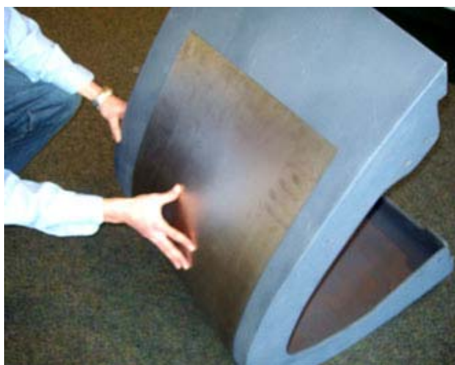
Representation of concept for a refractory metal overwrap. Mockup of the space shuttle orbiter RCC panel 9.

The Columbia accident has focused attention on the critical need for on-orbit repair concepts for leading edges in the event that damage is incurred during space shuttle orbiter flight. Damage that is considered as potentially catastrophic for orbiter leading edges ranges from simple cracks to holes as large as 16 in. in diameter. NASA is particularly interested in examining potential solutions for areas of larger damage since such a problem was identified as the cause for the Columbia disaster.