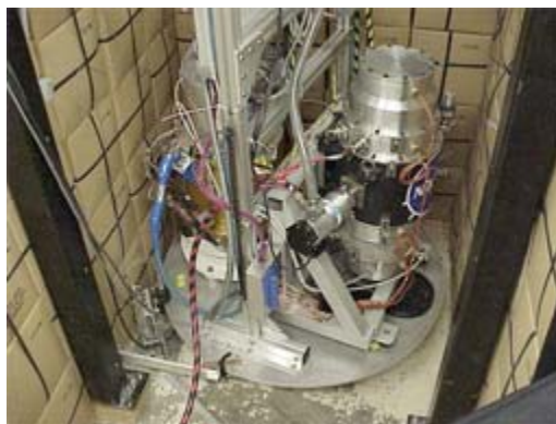
Test hardware for Integrated Power and Attitude Control System..

On September 14, 2004, NASA Glenn Research Center's Flywheel Development Team experimentally demonstrated a full-power, high-speed, two-flywheel system, simultaneously regulating a power bus and providing a commanded output torque. Operation- and power-mode transitions were demonstrated up to 2000 W in charge and 1100 W in discharge, while the output torque was simultaneously regulated between \pm 0.8 N-m.