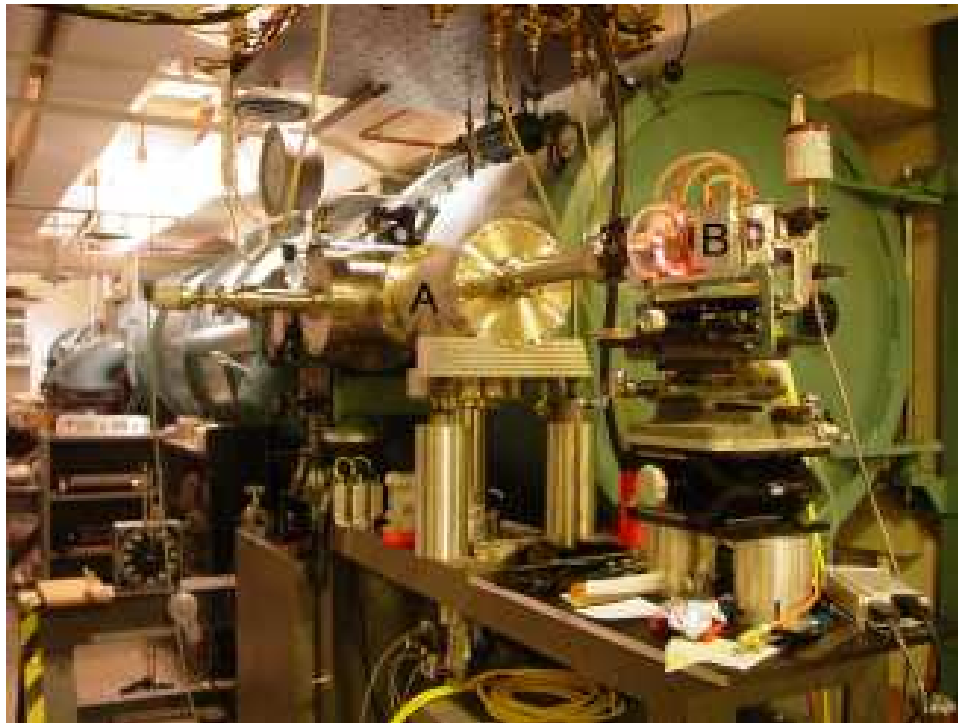
Fig. 1.— The 10.7-m normal-incidence vacuum spectrograph with foreoptics system.