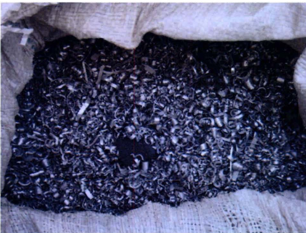
Figure 3: Aluminum chips for robot wheel.

After the completion of the robot's mechanical component design, a thorough investigation was performed on the availability of those components in the local market. The researchers had to rely on the reusable components wherever possible to imply. For example, aluminum chips collected from the lathe machine refusals were used to prepare the wheels of the robot. But because of the presence of too much slug, they did not appear to be a good choice for casting.