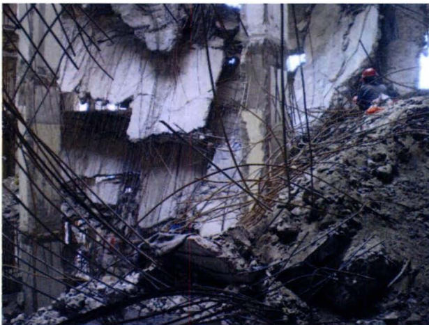
Figure 1: Actual site after the building collapsed in Dhaka, Bangladesh.

world claimed deadly and costly tolls to the affected communities [1]. Human-induced disasters in the form of civil-war, terrorist attacks etc. also have direct casualties not fewer than the natural disasters. Collapsed buildings are common field environment for humanitarian search and rescue operations. Earthquakes, typhoons, tornados, weaponry destructions, and catastrophic explosions can all generate damaged buildings in large scales. The use of heavy machinery in such incidents is prohibited because they would destabilize the structure, risking the lives of rescuers and victims buried in the rubble [2].