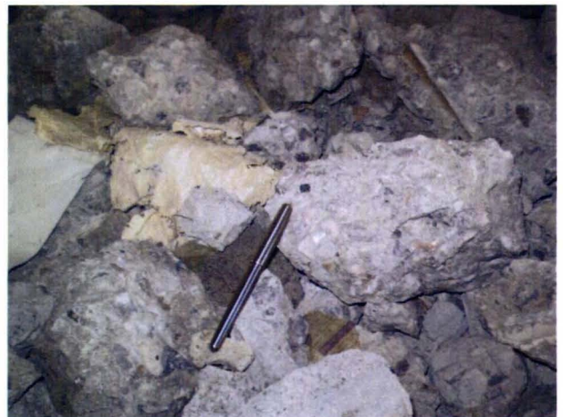
Figure 2: Comparison of the gravel size on site with a pen.

mostly populated cities in the world with the population density 14,608/km 2 [5]. With the population increase and urbanization, buildings are built for reasons, but in most cases without following proper guidelines and building codes. As a result, if a medium intensity of earthquake once strike Dhaka, the scenario will be disastrous. Keeping this fact in mind, a research work was carried out for the first time to make a machine help (hereinafter called rescue robot) for pro-disaster management and rescue purposes. The collapsed building site was investigated for getting the real life scenario after the disaster and also for the design purpose of the rescue robot to overcome all type of hindrance for rescue work.