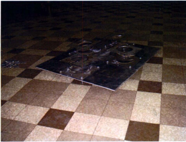
Figure 5: Spring plate to resist bumping.

movement through the rough terrain and also to overcome obstacles.