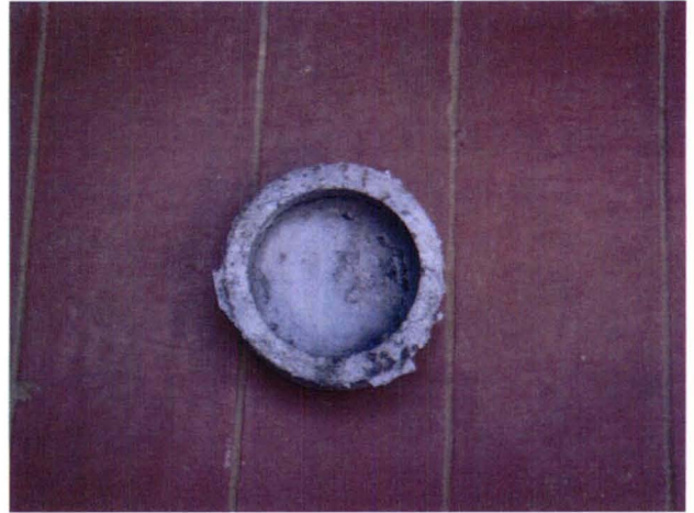
Figure 4: Robot wheel before finishing.

Then aluminum alloy automobile engine cylinders were melted and casted which showed very good performance for the casting. These cylinders were collected from the junkyards. Custom tires were prepared from heavy duty timing belts. This would help the robot to move about in a very rough terrain.