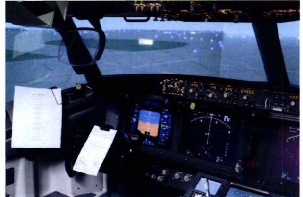
Figure 3: OPL's 737-800 Flight Simulation Facility

houses and maintains several research aircraft and flight simulators, including a 737-800 fixed-based flight deck that we will use to conduct the human-in-the-loop study (Figure 3).