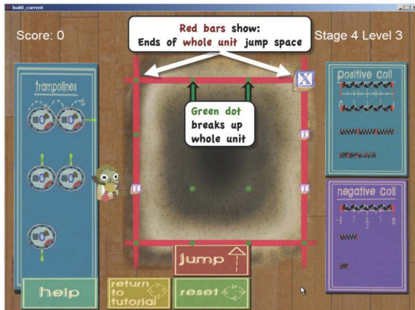
Figure 1. The intersection of the vertical bars depicted the boundaries of the whole unit. The green dots broke up the whole unit into intervals.

Once the students have figured out the unit size of the spaces on the grid, they needed to add together the correct number of coils that will span the distance to jump over. For example, in Figure 3, to get safely from one block to the next, Patch needs to jump over three one-third-unit intervals. This means that to successfully make it to the next block, the trampoline must contain three one-third-unit-sized coils. If the trampolines did not contain the correct number or size of