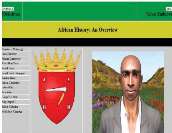
Figure 1. Instructional Environment