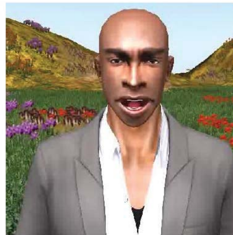
Figure 2. Animated Pedagogical Agent

In each instructional content page, the participant would see the title of the lesson (i.e., “African History: An Overview”), the progression menu, the title for the content of the page (e.g., “Kingdom of Mutapa,” “Great Zimbabwe,” “Zanzibar Island,” etc.), an image related to the content of the page and the animated pedagogical agent.