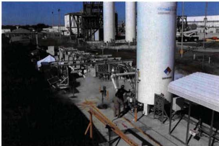
Figure 1. Simulated Propellant Loading System at the KSC Cryogenics Test Laboratory (Johnson, Notardonato, Currin & Orozco-Smith, 2012)

The testing environment for GODU LO2 is at the KSC Cryogenic Test Laboratory (CTL), and consists of a Simulated Propellant Loading System (SPLS) that mimics a system that would be found at a typical launch pad. The small scale SPLS – shown in Figure 1 – contains a liquid nitrogen system that simulates the LO2 system, a six kilo gallon propellant storage tank, a 500 hundred and two kilo gallon vehicle simulator tank, and control valve skids. A liquid nitrogen system is used for safety and cost purposes.