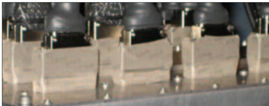
Figure 2. This picture shows the Implemented Design Concept . Conductive tape is wrapped starting with the pedestal, around the D connector, and ending at the cable backshell. This provides a continuous conductive enclosure that seals potential RF leakages from between the D connector and the chassis, and from between the cable plug and the connector receptacle.

EMC tests performed at JPL, D-connectors and micro-D connectors are known for compromising radiated emissions and causing test failures. There are two potential areas where radiated emissions can leak through: (1) the gap between the connector and the chassis (where the connector is mounted to), and (2) the gap between where the connector receptacle and the cable plug mates to. Both areas need to be shielded in order to reduce radiated emissions from leaking through these gaps. For this design, all D-connectors and micro-D connectors are mounted on an elevated surface area, known as the pedestal. The pedestal and the chassis are one piece of metal. For circuit cards that have the connector