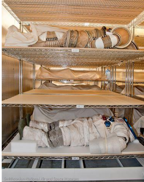
Figure 1. The Stephen F. Udvar-Hazy Center