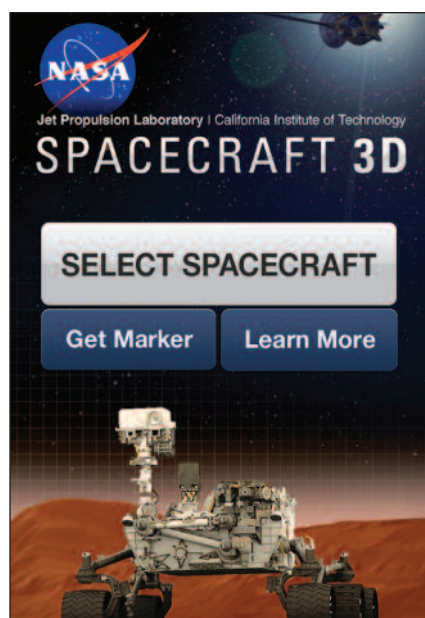
Spacecraft 3D Application allows one to interact and learn about different missions.

The software receives input from the mobile device's camera to recognize the presence of an AR marker in the camera's field of view. It then displays a 3D rendition of the selected spacecraft