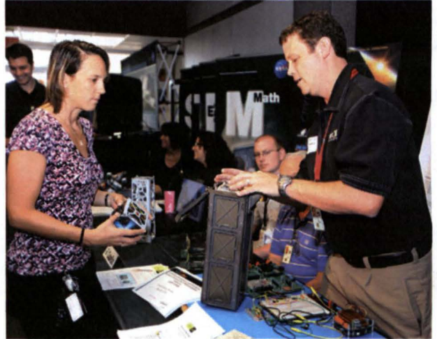
KSC engineers exhibit their technologies