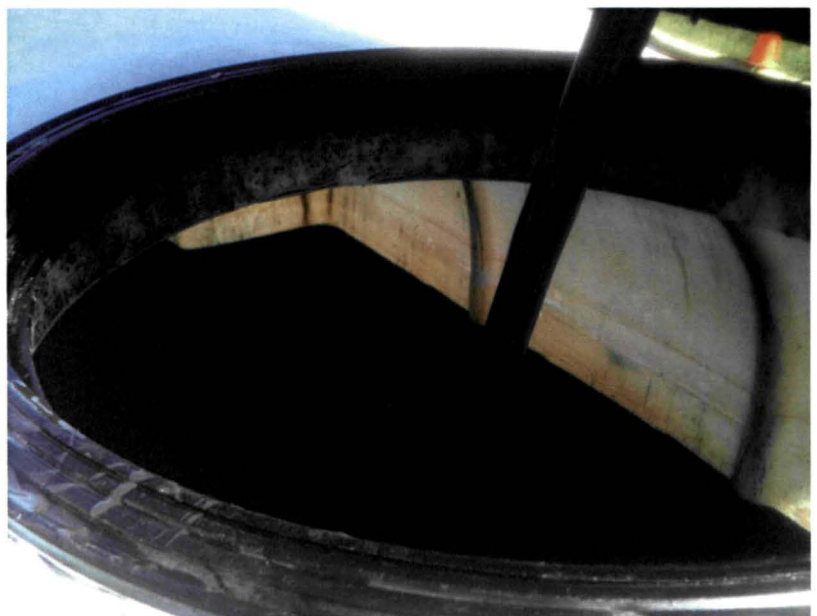
EZVI being transferred into injection tote