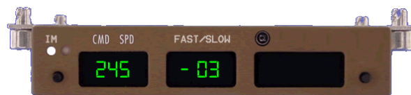
Figure 2. AGD presenting target and error speed values

Previous FIM research conducted at NASA LaRC has utilized datalink to transfer information from ATC to the flight crew. However, since the ground infrastructure necessary to support datalink will not be available during the