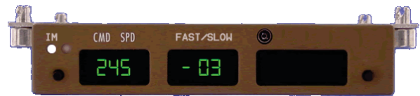
Figure 1. Prototype flight deck control display interface

FIM interface consisting of the IM application running on side-mount electronic flight bags. Target and error speed values are shown on ADS-B guidance displays mounted in the forward field of view.