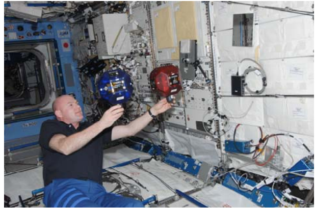
Figure 4: View of the Synchronized Position Hold, Engage, Reorient, Experimental Satellites Zero Robotics (SPHERES) in the Japanese Experiment Module (JEM). Flight Engineer Andre Kuipers (ESA) is conducting a test of the SPHERES Satellites.

Butterflies, Spiders and Plants in Space is an example of utilizing the unique environment of the ISS for the area of education demonstrations and activities. This program through a collaborative effort between BioServe Space Technologies and Baylor College of Medicine's BioEd Online [13] conducted four life science experiments between 2008 and 2012. These experiments featured Araneidae (orb-weaver spiders), Vanessa cardui (painted lady butterflies), Nephila clavipes (golden orb spiders) and Brassica rapa (mustard seeds) as the subjects (Figure 5). During their time on orbit, video and photos were taken and have now been added to an archive where teachers today can