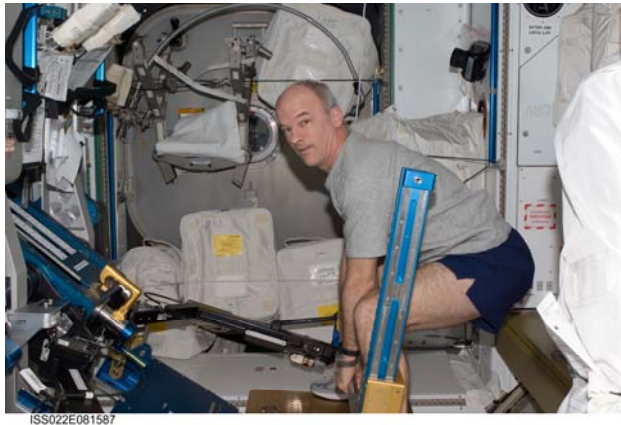
Figure 2: NASA astronaut Jeffrey Williams, Expedition 22 commander, exercises using the Advanced Resistive Exercise Device (ARED) in the Tranquility node of the International Space Station.

Preventing loss of overall bone mass is the beginning of the story. To evaluate risk of fracture, advanced imaging techniques, such as dual-energy X-ray absorptiometry (DXA) and quantitative computed tomography (QCT), were used to evaluate bone density and architecture. Early studies data was used to predict the amount of bone loss expected for each crewmember. With the addition of QCT scans, bone geometry has been evaluated to determine bone strength and fracture risk. Recommendations for using both types of imaging, resistive exercise, proper nutrition and pharmaceuticals (such as alendronate) to reduce bone loss have been released by the NASA Bone Summit panel. [8]