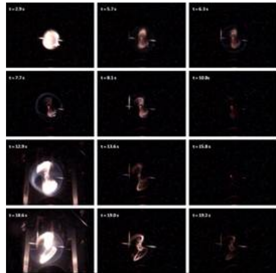
Figure 3. Ignition of 4.5mm droplet on tethering fibers (crossed fibers shown as glowing lines) developing into a large weak flame which quickly radiatively extinguishes ( t = 10.8 seconds). This is followed by period of low-temperature burning ( \sim 2 seconds) with no visible flame, which is then followed by a brief return to high-temperature burning marked by a flame burst (lasting about 1.5 seconds at t = 12.9 seconds). This cycle repeated once, until the fuel droplet was completely consumed. (NASA).

This unexpected discovery led researchers to examine n-octane and decane fuels where they found similar two-stage burning. Applications of these new discoveries include modifications in numerical models that predict flame, fuel and combustion behaviors; and could lead to pollution reduction and better gas mileage in combustion engines on Earth.