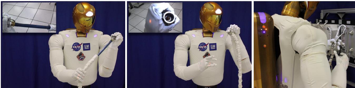
Figure 2: R2 working with EVA hoses and a tether hook.

Work on the ground continues to build the skill set for an EVA Robonaut. Recent experiments (Figure 2) demonstrate how a teleoperator can use R2 to manipulate a tether hook, an important safety precaution on spacewalks. Another task displayed Robonaut's ability to pull back a protective jacket over a hose and search for damage, as well as inspect a quick-disconnect fitting for debris. Demonstrations such as these are indicative of EVA work done on ISS, specifically seen during a series of spacewalks over 2012 and 2013 where astronauts searched for an ammonia leak in one of the external cooling loops