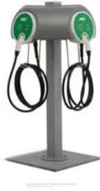
a. AeroVironment EVSE-RS+