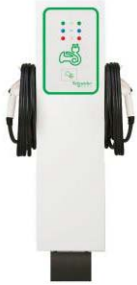
c. Schneider Electric EV230PDRR