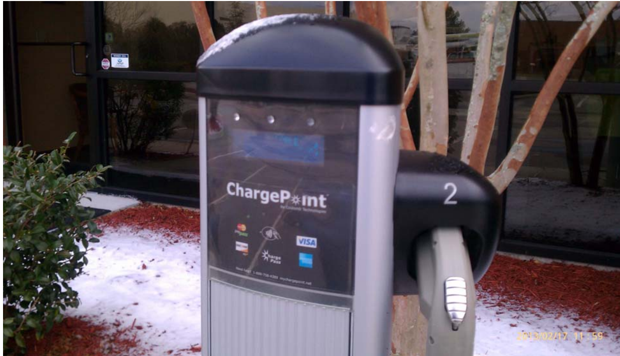
Figure 5. Close up of ChargePoint CT2021 screen.