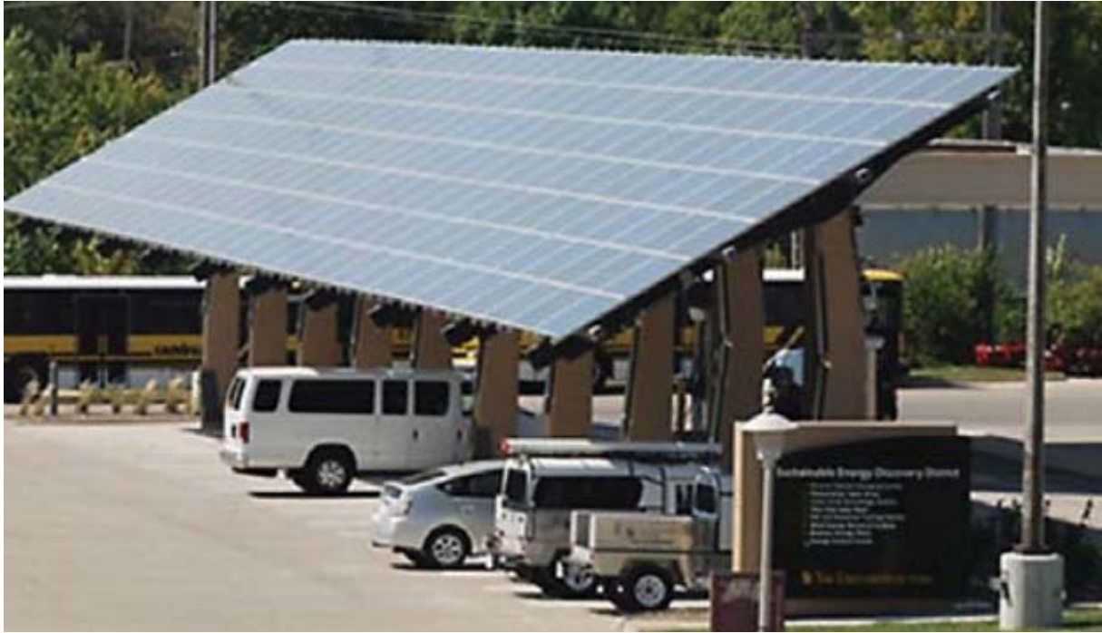
Figure 2. Charging station with solar panels at the University of Iowa.