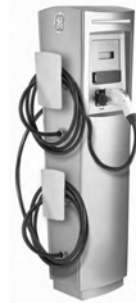
d. GE DuraStationNEMA3R