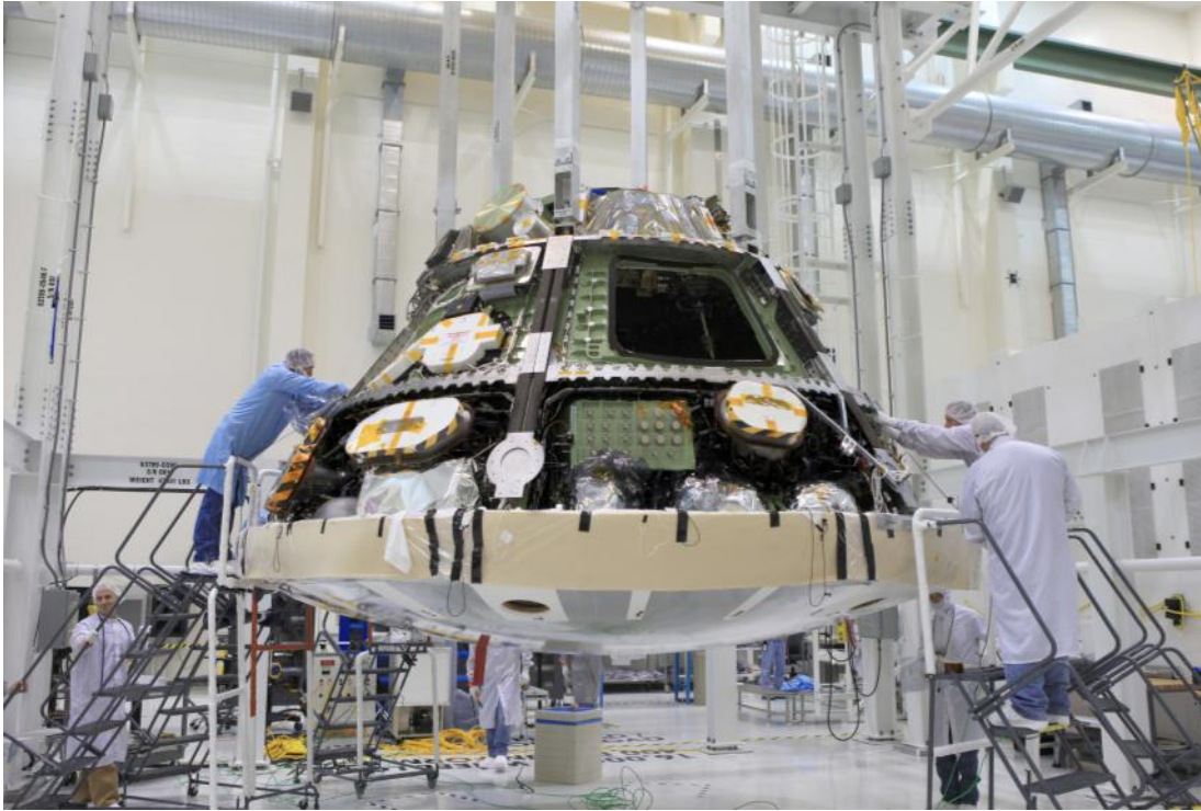
Figure 3: Orion EFT-1 Crew Module During Assembly