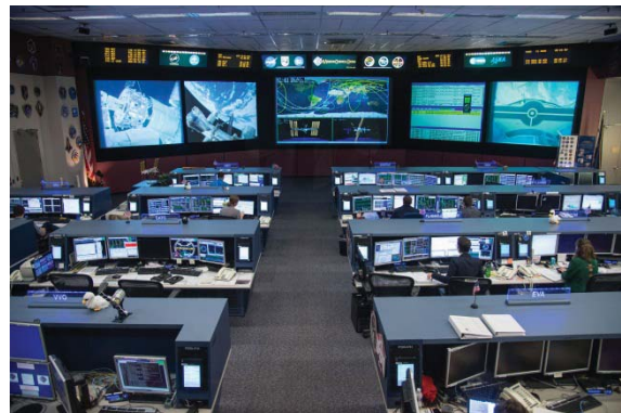
Figure 3: Mission Control Center, Houston, Texas International Space Station Control Center

In support of these spaceflight operations, the MCC-H operates under rigorous operations standards and processes that preserve the integrity of each vehicle design and manage