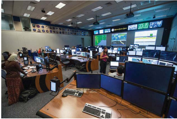
Figure 2: Mission Control Center, Houston Texas (MCC-H) Exploration Control Center

The Mission Control Center – Houston (MCC-H) at the Lyndon B. Johnson Space Center (JSC) supports the ascent flight operations for the SLS. Flight operations begin at launch and go through separation of the Orion from the SLS core stage and the splash down of the core stage down range. 3,4,5,6