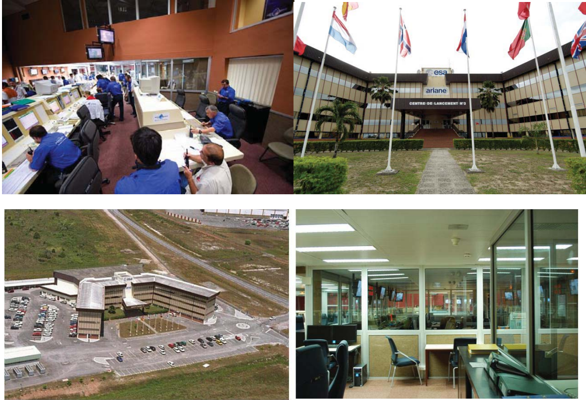
Figure 6: CDL3 and View inside Blockhouse

Readiness for launch is given to the DDO and to the CM by the COEL concerning the launcher and to the CM by the spacecraft customer's representatives concerning the spacecraft. The CM transfers Arianespace's Management launch decision to the DDO. Authorization to launch is eventually provided by the CNES high level Safety Authority (i.e. CSG Director) to the DDO who lets the launcher final automatic sequence proceed (the so called Synchronized Sequence) until liftoff.