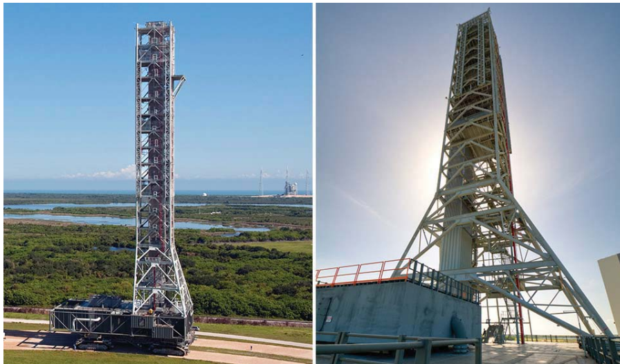
Figure 1: Newly Design Mobile Launcher for SLS (KSC)

The Launch Control Center (LCC) at the Kennedy Space Center in Florida is a multi-vehicle launch site that supports the final assembly of major non-commercial flight vehicles, their fully integrated testing, and performs processing through launch. Pre-launch processing begins with integrated testing in the Vehicle Assembly Building (VAB) and continues through the movement of the vehicle on the Mobile Launcher (shown in Figure 1) to the Launch Pad.