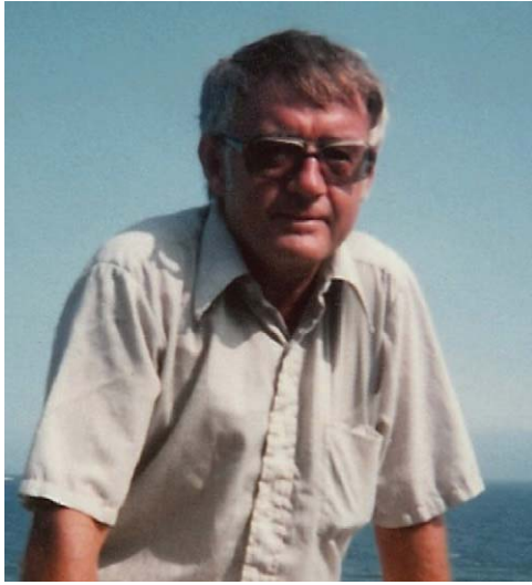
Fig. 1. Peter Cary Waterman (1928–2012).