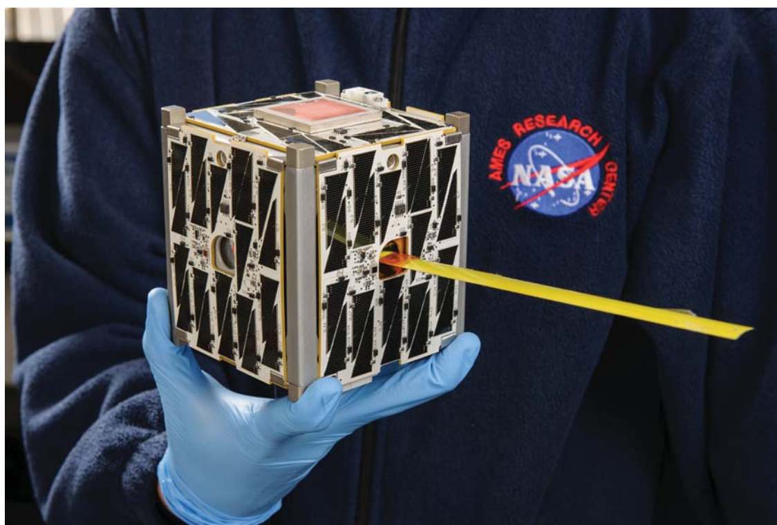
PhoneSat 2.5