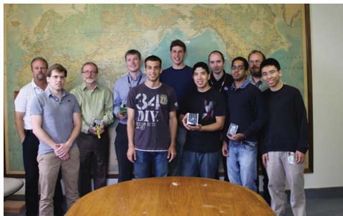
The PhoneSat team at NASA Ames Research Center

The PhoneSat project is series of a technology demonstration missions funded by the Small Spacecraft Technology Program (SSTP), one of nine programs within NASA's Space Technology Mission Directorate, and the Engineering Directorate at NASA Ames Research Center. The SSTP develops and matures technologies to enhance and expand the capabilities of small spacecraft with a particular focus on communications, propulsion, pointing, power, and autonomous operations. The PhoneSat project started in summer 2009 as a student-led collaborative project between NASA Ames and the International Space University, Strasbourg.