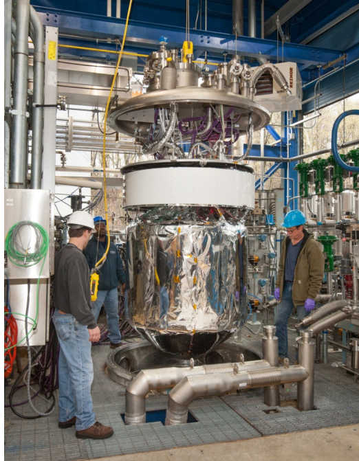
Figure 1.—Liquid Hydrogen (LH 2 ) RBO Experiment Test Article Being Lowered into SMiRF Vacuum Chamber. The white ring above the test tank is the heat pipe radiator, behind which is mounted the reverse turbo-Brayton cycle cryocooler.

The purpose of the testing was twofold. First it would demonstrate the integration of a BAC shield embedded in tank-applied thick MLI to a flight representative cryocooler. Second, it would quantify the system thermal performance of a flight representative active thermal control system for RBO storage of LH 2 in a simulated space environment. The testing was conducted at Glenn Research Center's (GRC) Small Multi-Purpose Research Facility (SMiRF), which provided the thermal and vacuum environment to simulate space-based conditions. The test article at SMiRF is shown in Figure 1.