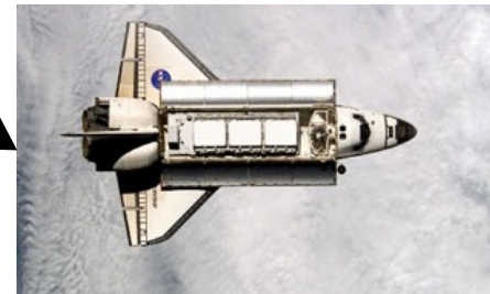
Space Shuttle Flight Control