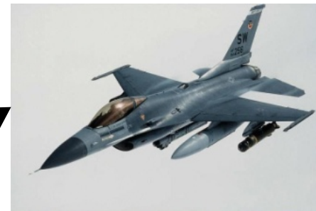
Modern Military Aircraft