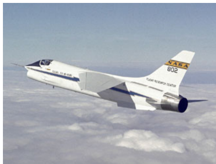
Early fly-by-wire prototype