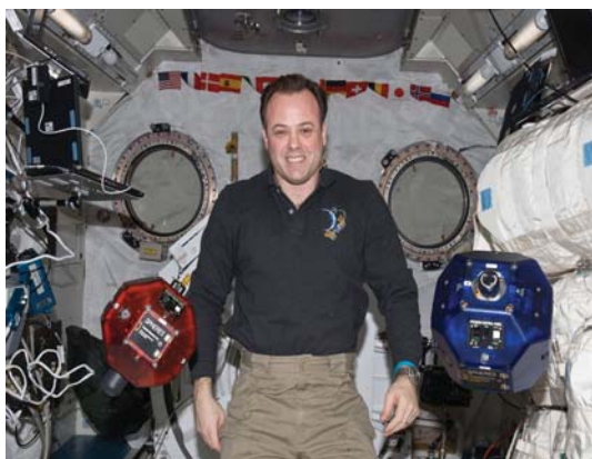
SPHERES Red and Blue during a Test Session

SPHERES consists of three self-contained satellites, which are 18-sided polyhedrons that are 0.2 meter in diameter and weigh 3.5 kilograms. Each satellite contains an internal propulsion system, power, avionics, software, communications, and metrology subsystems. The propulsion system uses carbon dioxide (CO 2 ), which is expelled through the thrusters. SPHERES satellites are powered by AA batteries.