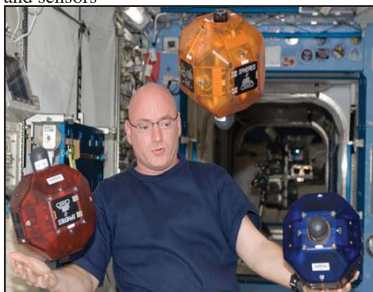
SPHERES Red, Blue and Orange during a Test Session

SPHERES is an ongoing demonstration. Each session tests progressively more complex two and three-body maneuvers that include docking (to fixed, moving, tumbling targets), formation flying and searching for lost satellites.