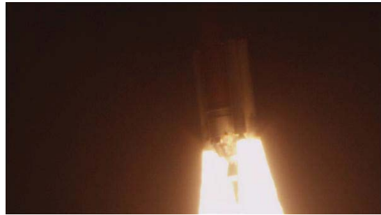
Figure 14: RED EPIC HDR 6 Mode Illustrating Dual Exposure, A Frame

Current work is evaluating emerging HDR video solutions such as the RED EPIC/DRAGON with HDR setting of 6 stops, Figures 14 and 15 [Kar14], and the HDR video solution from the University of Warwick/goHDR. It is clear that future dynamic range workflows will require an examination of the entire digital process from capture to display.