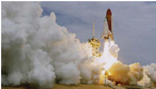
Figure 12: ARRI Alexa 120 FPS Sample Frame