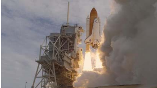
Figure 10: RED ONE M 4K Sample Frame