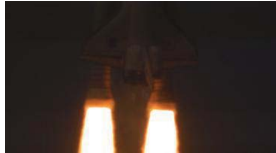
Figure 8: HD1100 Cam A (f/20 exposure)

The HDR image generated from the HD1100 exhibited some detail over a greater range than did imagery from either camera individually (see Figures 7 and 8).