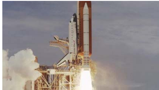
Figure 13: RED EPIC Sample Frame

Lab tested for 11.5 stops at 0.5 stop RMS noise, LogFilm mode (HDR not yet utilized), Figure 13.