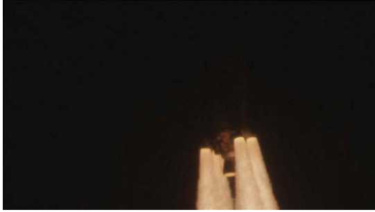
Figure 15: RED EPIC HDR 6 Mode Illustrating Dual Exposure, X Frame

http://vimeo.com/advancedimaginglab/hdr . [Accessed 25 January 2014].