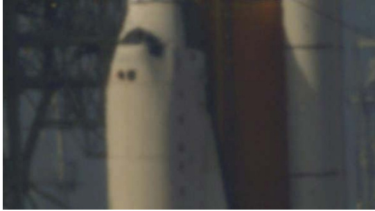
Figure 3: HD1100 Cam A (1/60 exposure)