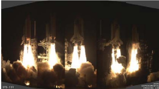
Figure 5: RED ONE Composite of 5 Camera Sites

The cameras were configured for STS-131 [SHK*10a] to acquire imagery of the launch from five camera sites around the pad perimeter (see Figures 5 and 6). Deployed in pairs to each site, the cameras provided imagery not only for HDR testing purposes, but also to generate stereoscopic 3D image sets.