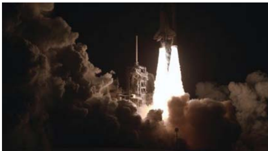
Figure 6: RED ONE Camera Site 3 Single Frame

The RED ONE M experiment was successful in illustrating the capability of single exposure digital imagers at that time. Lab testing has shown that the RED ONE M has a dynamic range of 10.4 stops with 0.5 stop RMS noise, Log mode.