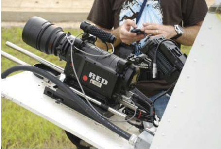
Figure 9: RED ONE M 4K Setup