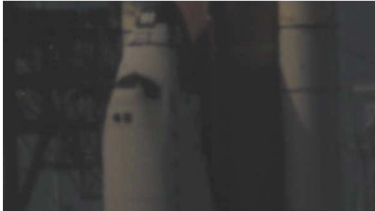
Figure 4: HD1100 Cam B (1/300 exposure)