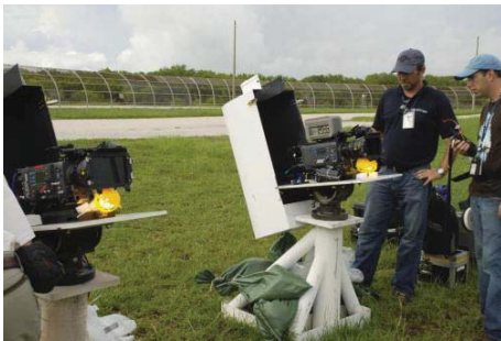
Figure 11: ARRI Alexa Setup

Lab tested for 13.9 stops at a 0.5 stop RMS noise, Log mode (Figures 11 and 12).