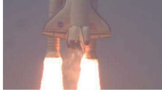
Figure 7: HD1100 Cam A (f/10 exposure)

These cameras with matched 80in focal length Meade telescopes were again used for a dual imager HDR experiment during STS-132 [CHK*10b].