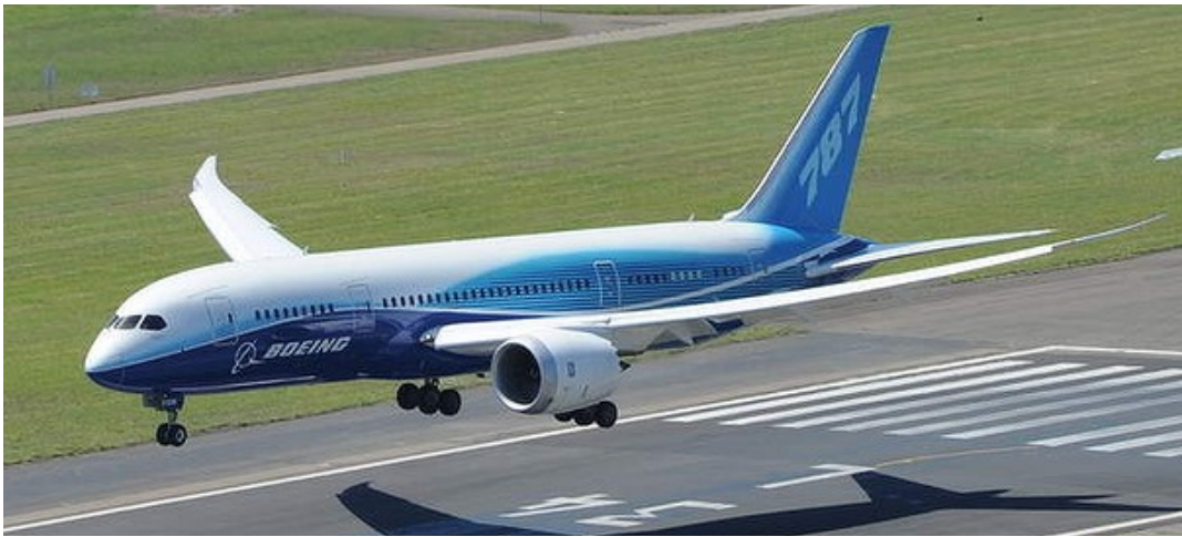
Figure 1. Boeing 787.

manufacturing technologies that are both more affordable and more efficient. This paper describes the ISAAC ( Integrated Structural Assembly of Advanced Composites ) environment that is being developed to help to address many of NASA's critical needs in both advanced composite structures and materials, as well as enable future development, integration and assessment of new advanced manufacturing technologies from NASA and its partners in academia and industry.