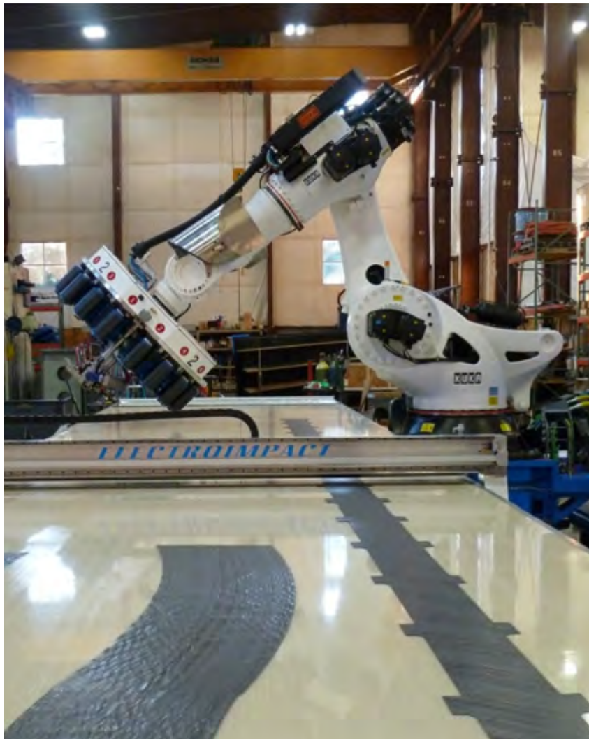
Figure 3. Robotic fiber placement system (Electroimpact).

The positioning accuracy and precision of the commercial robot that provides the mobility platform for ISAAC is improved by an order of magnitude through a combination of digital encoders, secondary feedback and computer numerical control. The highly modular system architecture also greatly reduces the potential for overall obsolescence, as individual hardware or software components can be replaced or upgraded over time. A digital “flight data recorder” logs all process information during AFP operations, which allows performance of post-hoc analyses of these data to understand both correlation and causal links between composite materials, manufacturing and the resulting structures.