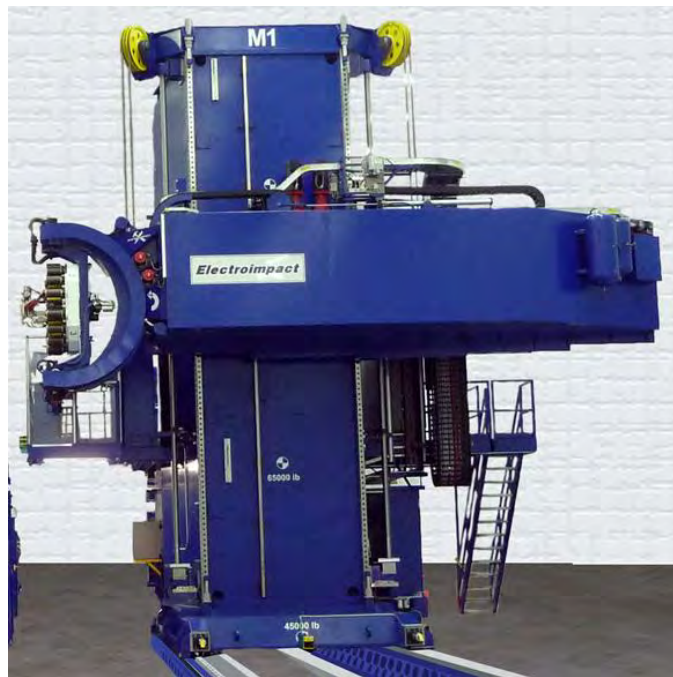
Figure 2. Large fiber placement system (Electroimpact).

systems located at the Michoud Assembly Facility [3]. These older machines would each require multi-million dollar modifications to upgrade them to the state-of-art in AFP, and even then would still lack the inherent flexibility to perform processing operations other than AFP.