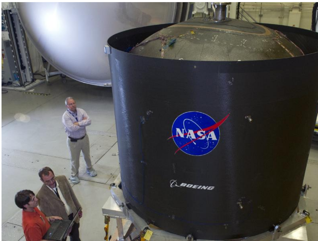
Figure 6. 2.4m-diameter composite cryotank.

If used to support future projects like CCTD, the ISAAC system would enable NASA to internally develop material processing parameters, establish tow-steering limitations, fabricate coupon and joint test specimens, and create manufacturing demonstration units, all prior to handing off full-scale fabrication to a contractor. Greater NASA involvement in the process development phase of a large composite program will allow exploration of the broader trade space, instead of focusing on limited point designs. In addition, any resulting material processing and fabrication procedures are then owned by the U.S. Government, thus allowing dissemination to the greater aerospace community, and simultaneously making the government a smarter buyer.