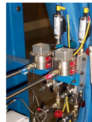
Portable New Delivery System (PNDS)