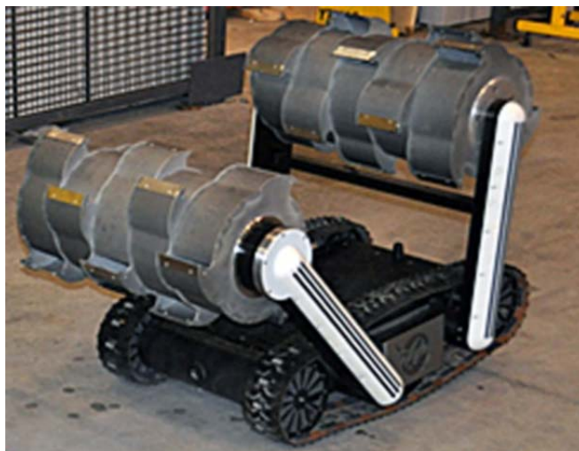
Figure 1. The NASA KSC robotic excavator known as RASSOR.

In order to design and evaluate low-force penetrator and excavator systems for exploration on planetary surfaces, it is important to understand the geotechnical properties of planetary regolith (Alshibli 2009; Carrier 1991; Gamsky 2010; Klosky 2000; Zeng 2010), and to test these systems using terrestrial analogs of planetary icy regolith produced under relevant conditions. NASA Kennedy Space Center has developed techniques in recent years to excavate dry regolith simulant in large testbeds under ambient conditions, e.g. the Regolith Advanced Surface Systems Operations Robot [RASSOR] shown in Figure 1 (Mueller 2013).