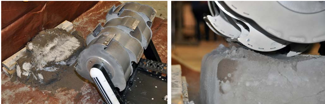
Figure 2. RASSOR's bucket drum is shown excavating icy regolith formed by cryo-freezing BP-1 simulant mixed with water using a 10:1 ratio of regolith to water.

Field testing of the RASSOR excavator was conducted both indoors and in an outdoor pit that contained the blocks of icy regolith made with BP-1. The RASSOR was operated in a double bucket dig mode and gravity off-loaded to simulate lunar gravity with its tracks in contact with frozen dirt. This preliminary testing served as a proof-of-concept that the rotating bucket drums of RASSOR could be used to break up the icy regolith for excavation regardless of the hardness.