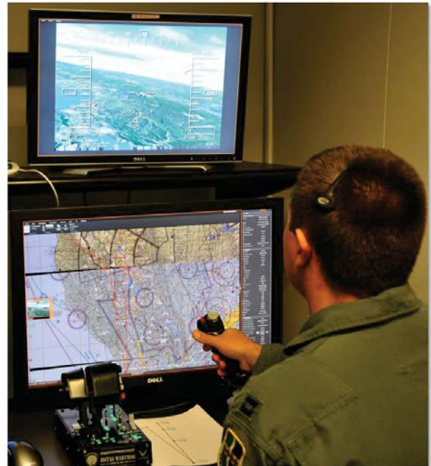
Figure 3. Simulation 3 GCS set up with the Manual HOTAS control mode.

Overall the results of the Rorie & Fern study directly demonstrate the substantial effect that control mode interfaces can have on pilots' ability to comply immediately to ATC commands. Further, these results can be extrapolated to likely response times for pilots using various control mode interfaces to respond to self-separation and collision avoidance alerting, a critical component of any future Detect and Avoid (DAA) system for UAS.