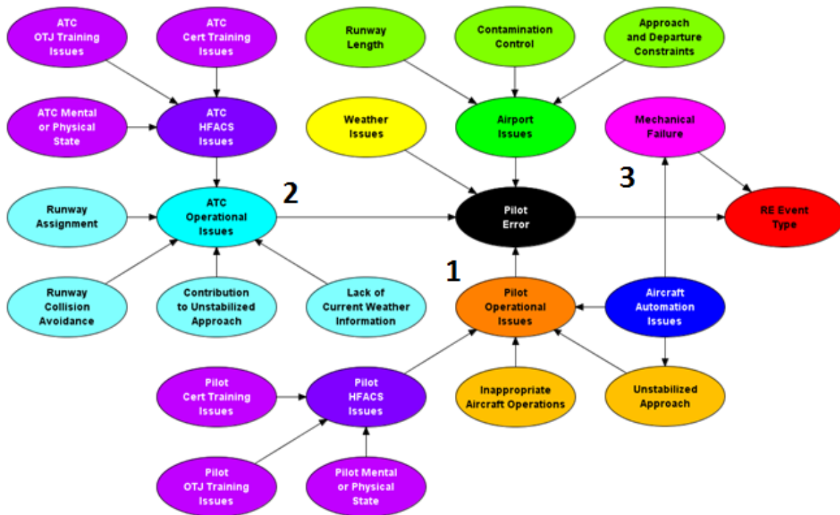
Exhibit 2. The Runway Excursion Bayesian Belief Network.

This concludes the presentation of the RI event model. Likewise, the SME panel vetted many of the proposed definitions and most of the proposed model structure of the RE event model, shown in Exhibit 2 . The SME panel again provided significant clarification of several essential definitions within the RE event model. Moreover, the SME panel suggested several simplifying structural changes to the model. The remainder of this section describes the current preliminary RE event model. The node name for each is presented along with some clarifying comments. Again, most of the nodes are binary with only two possible states (present as in issue in RE Events or not); where more states are present in a node, this will be made clear from the explanation of the node given subsequently.