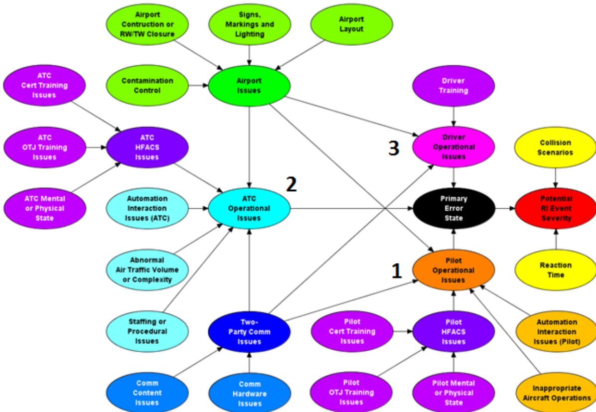
Exhibit 1. The Runway Incursion Bayesian Belief Network.

The reader should first observe the numbers in Exhibit 1, representing the three possible primary participants in an RI event: 1 is the pilot or pilots (orange node), 2 is the air traffic controller (ATC) or controllers (cyan node) and 3 is a airport or contractor vehicle driver (pink node). Each of these nodes has a number of other color-coded nodes with links pointing into these three primary nodes. Likewise, each of these three primary nodes have links pointing into the black node (Primary Error State). Starting with the green nodes (middle top), and moving counter-clockwise, the node descriptions of the RI event model follow: