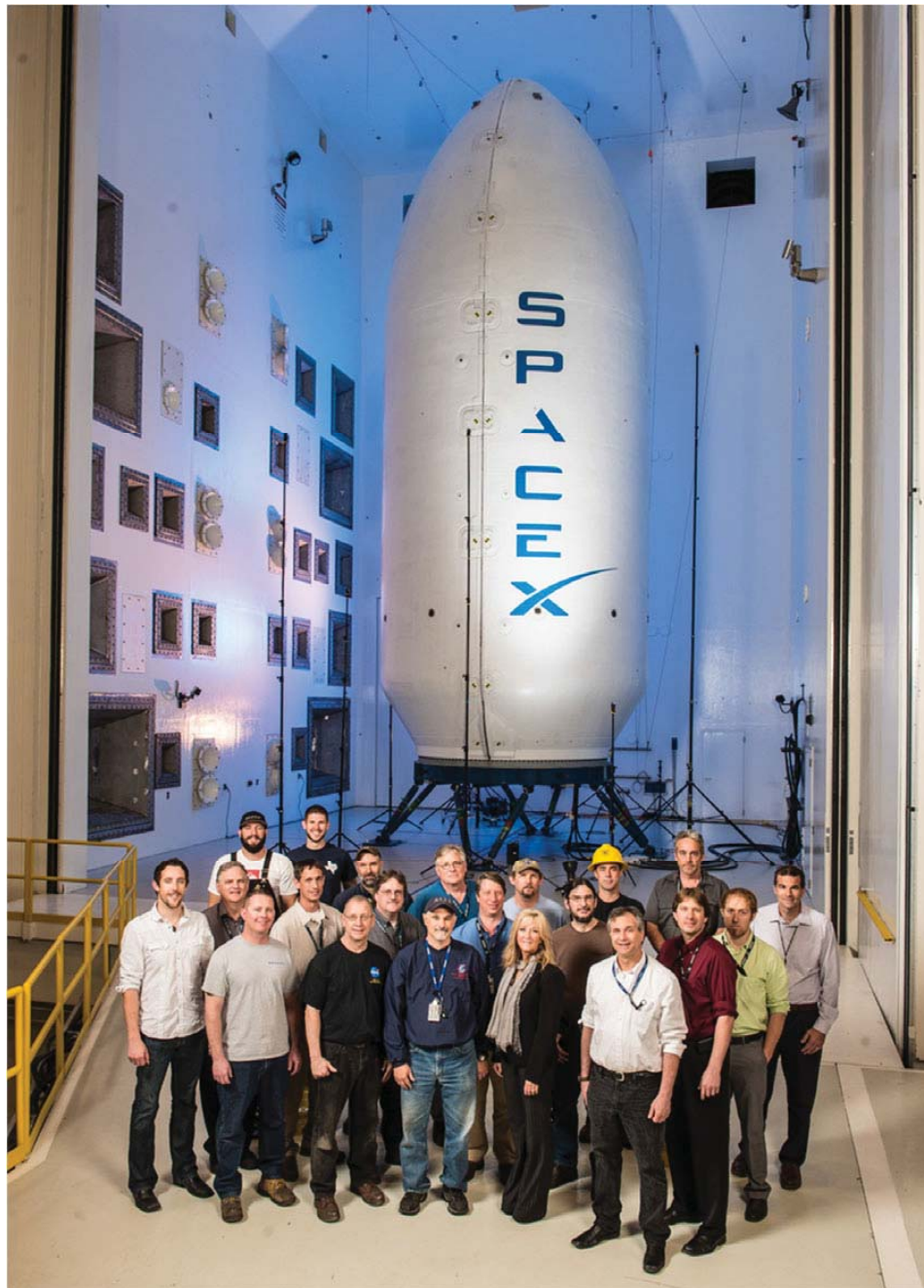
Figure 1.—The SpaceX Falcon 9 Payload Fairing was successfully tested at the NASA Glenn Research Center Plum Brook Station's Reverberant Acoustic Test Facility (RATF) during May to June 2013.

The Reverberant Acoustic Test Facility (RATF) at the NASA Glenn Research Center Plum Brook Station in Sandusky, Ohio is an example of a large-volume (101,000 ft 3 ), very powerful (163 dB OASPL) reverberant acoustic test chamber (Refs. 2 and 3) which uses GN2. Figure 1 is a photograph of the SpaceX Falcon 9 Payload Fairing in this NASA test chamber. The volume of the Falcon 9 test-article was 10 percent of the NASA RATF's empty chamber volume.