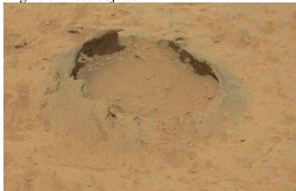
Fig. 1. Hollow spherical feature observed on sol 122 in the Yellowknife Bay area. The visible portion is 16 cm in diameter.

Overview: The Curiosity rover traverse in Gale crater has explored a large series of sedimentary deposits in an ancient lake on Mars. Over the nine kilometers of traverse a recurrent observation has been southward-dipping sedimentary strata, from Shaler at the edge of Yellowknife Bay to the striated units near the Kimberley [1]. Within the sedimentary strata cm- to decimeter-size hollow spheroidal objects and some apparent cylindrical objects have been observed. These features have not been seen by previous landed missions. The first of these were observed on sol 122 in the Gillespie Lake member at Yellowknife Bay (Fig. 1). Additional hollow features were observed in the Point Lake outcrop in the same area. More recently a spherical and apparently hollow object, Winnepesaukee, was observed by ChemCam and Mastcam on sol 653. Here we describe the settings, morphology, and associated compositions, and we discuss possible origins of these objects.