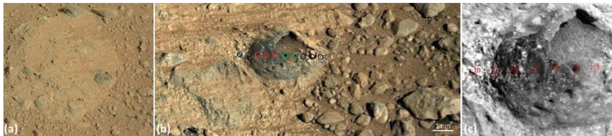
Fig. 2. Winnepesaukee hollow spherical feature shown at increasing resolution left to right. (a) Right Mastcam, sol 654; (b) Color merge of RMI with left Mastcam, sol 654. Circles indicate the locations of ChemCam LIBS observations; colors indicate compositional detail. Red = basaltic; black = felsic; green = soil. Sequence starts from right. (c) RMI mosaic taken after the laser shots, locations indicated.