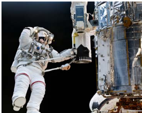
An astronaut conducts an EVA to repair equipment. Participation in EVAs and the associated ground training is a risk factor for shoulder injuries.

The purpose of this occupational health study was to determine the incidence rate of shoulder injuries incurred by NASA astronauts during their active duty NASA career and determine if the rate of injury has changed over time.