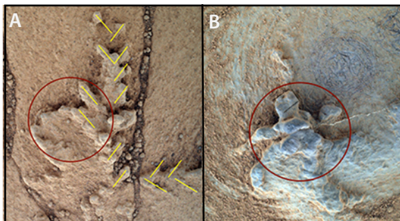
Figure 4. MAHLI images of diagenetic features at Pahrump. (A) The dendrite “Mammoth” with primary lathe orientations highlighted in yellow. (B) The crystal cluster “Meonkopi” reveals clear scratch marks where brushed by the DRT. Although more erosionally resistant than the surrounding outcrop, these diagenetic features do not appear to have unusual hardness. Red circle in both images is the apparent footprint of the APXS.

Additional details appear when viewed with the Mars Hand Lens Imager (MAHLI). First, within dendrites, individual lathes record uniform divergence angles between 87-89° (Fig. 4). Such uniformity in divergence angle suggests that this reflects the original growth. If diverging lathes represent twinning, the crystal angles are consistent with a number of evaporite minerals, including anhydrite and magnesium sulfate. Second, despite a uniformity in apparent crystal divergence, little textural evidence remains to aid in the diagnoses of original mineral form. Features are more resistant to erosion than the surrounding bedrock, but remain relatively soft (as seen by scratch marks made by the Curiosity rover's Dust Removal Tool (DRT) (Fig. 4). Individual lathes also show little evidence of discrete crystal faces. Rather, a bumpy, or nodular surface structure suggests either differential erosion of the diagenetic features, or perhaps modification of crystal faces by secondary nucleation points. Additionally, MAHLI images of DRT-brushed regions, there is little difference in color or microscale texture between the crystal clusters and surrounding bedrock, both appear to be grey in color lathes appear to incorporate grains from the surrounding host material.