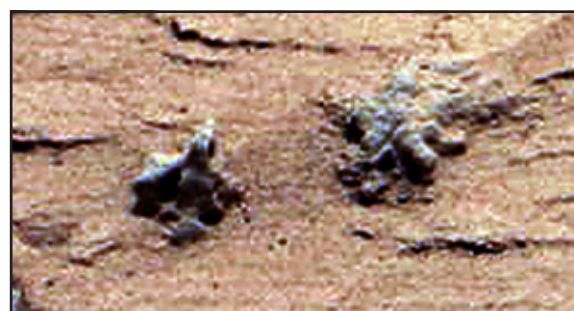
Figure 3. Diagenetic crystal clusters within laminated mudstone at Shoemaker. Host rock shows no indication of deformation during crystal growth. [from 0799MR0034930040500192E01]

Dendritic structures are generally larger (branches often >3 cm along growth direction) that crystal clusters and show predominantly planar growth—potentially aligned with bedding planes. As with crystal clusters, individual lathes within the dendrites are elongate and pseudo-rectangular in cross-section. Unlike crystal clusters, dendritic morphologies appear to