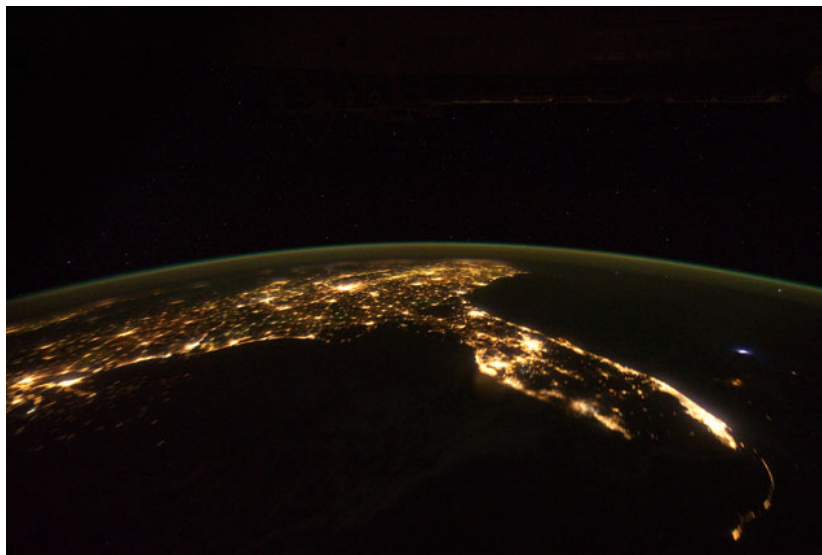
Figure 2.— Time-lapse image of Florida and the southeastern United States at night (ISS030-E-6082, 11/24/2011, 19 mm), which is part of the video entitled “Mexico and the Eastern United States.”