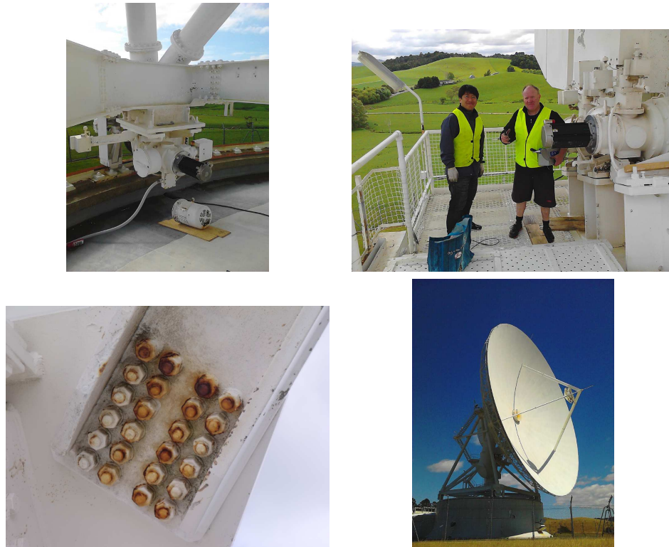
Figure 2: The 30 m: Top left, one of the old azimuth motors being replaced. Top right, Tim and Takiguchi having finished replacing one of the elevation motors. Bottom left, an example of the corrosion we have to get on top of. Bottom right, with the new motors and control system we are now able to move the dish once again.

the maser at the 12 m over to the 30 m pedestal room using a Symmetricom RF via fiber system.