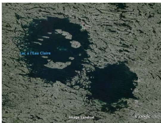
Fig. 1. Landsat image of the West (left) and East (right) Clearwater Lake impact structures.

Introduction: The West and East Clearwater Lake impact structures are two of the most distinctive and recognizable impact structures on Earth (Fig. 1). Known regionally as the “Clearwater Lake Complex”, these structures are located in northern Quebec, Canada (56°10 N, 74°20 W) ~125 km east of Hudson Bay. The currently accepted diameters are 36 km and 26 km for the West and East structures, respectively [1]. Long thought to represent a rare example of a double impact, recent age dating has called this into question with ages of ~286 Ma and ~460–470 Ma being proposed for the West and East structures, respectively [2].