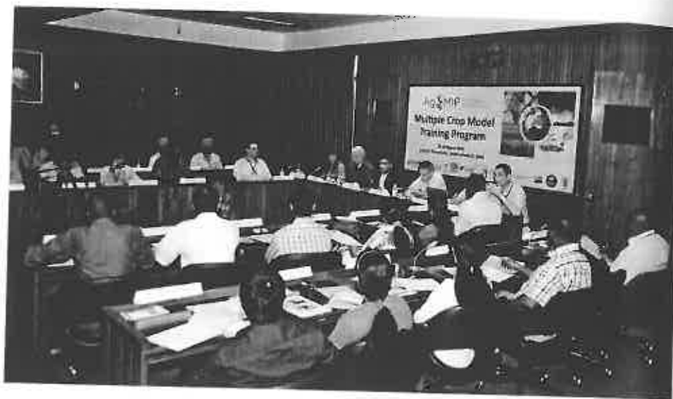
Fig. 1. Initiation of multi-model training course activities in the learning systems unit at the ICRISAT, Andhra Pradesh, India.