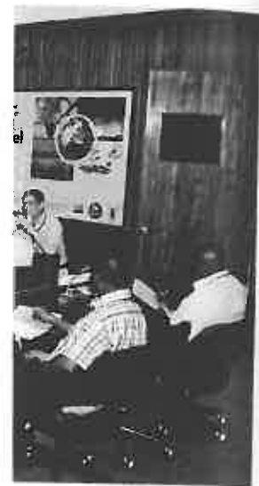
systems unit at the ICRISAT.

We assisted in analyzing simulated results and in computing the mean and plotting the cumulative probability of exceedance for the observed farm survey yields and model-simulated yields on the same graph. Figure 2 illustrates the probability of exceedance of a given yield level for farmer survey yields, compared with the yields simulated by DSSAT and APSIM for peanut fields near Nioro, Senegal in