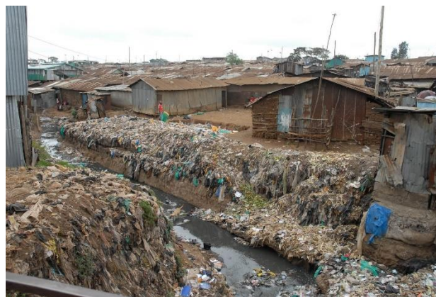
Figure 1. Polluted stream bank in Kibera, Nairobi, Kenya (Source: Kibera slum, Nairobi, Kenya: UrbanHell, by Ann Hartman, 2014).

Kibera is the largest informal settlement area in Nairobi City, Kenya. Its population is about 800,000 inhabitants, over 90% of whom are tenants (Kibera, 2018) (Figure 1). Residents use stream banks and space around the settlement to grow their own food, yet along with the increase of the population, they also use gardening sacks to compensate for the lack of space. There are dozens of NGOs collaborating with the communities and local government to upgrade settlement conditions and some initiatives developed elements of GI infrastructure to mitigate flooding risks.