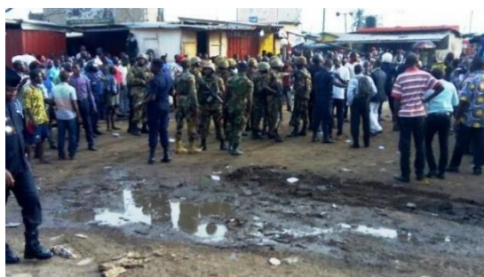
Figure 6. Eviction for completion of the flood mitigation infrastructure.

conflict because the new location and its infrastructure have not yet been completed. A severe flood event on 2015, leaving 150 people dead, ignited the central government to order a massive eviction of over 50,000 people to complete a flood mitigation project combining grey and green infrastructure within a public funding scheme (Figure 6). Despite the relocation in 2015, the implementation of the initiative still takes a long process as the bulk of the settlement remains in the floodplain area of Old Fadama. The community of Old Fadama is sceptical about this program of relocation, upgrading and infrastructure development because it threatens the benefits they have from the mega-slum. It seems this view comes from low participation in the planning process. For instance, the relocation sites are far from current job sites. From this case it can be concluded that conflicts and long processes relate to a lack of understanding of economical issues such as job accessibility; land ownership; interdependence between the elite and the poor; and failure of public participation and consultation, governance and leadership. This is exacerbated by low public funding commitment as Old Fadama is not recognized in any government urban plans.