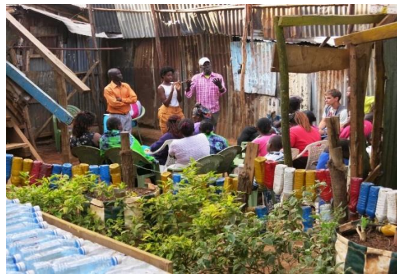
Figure 2. Public discussion on GI development in Kibera, Nairobi, Kenya

Despite many interventions being completed by NGOs in Kibera, the residents suggest that to be effective, the external initiatives of NGOs must not be imposed but carried out by residents and community leaders. The example of KDI illustrates that the development of GI can be implemented successfully within informal settlements with full cooperation of the local community and mediating the local political interests with minimal funding resources.