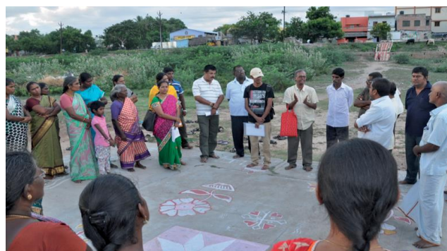
Figure 4. A shared vision among diverse groups by using a participatory approach.

Assisted by public funding, this program is now being implemented. This initiative shows that establishment of GI is an effective way of reducing the impacts of climate change related floods in the city of Madurai, India. The plan's development suggests that to introduce such an approach