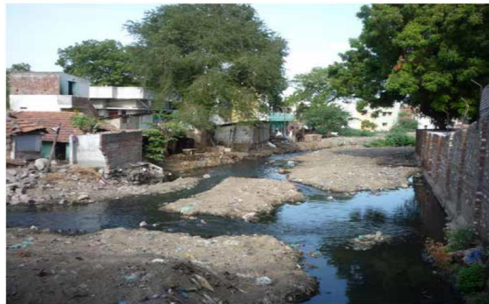
Figure 3. Polluted river water resources in Madurai, Tamil Nadu, India.

Responding to the pressures on urban resources such as land and water due to the increasing population, in 2013, Atkins in partnership with UCL, DFID and the Madurai City Corporation developed an integrated assessment framework for the Future Proofing Cities project (Indian Cities Madurai Corporation, 2014). It acknowledged the complexity of the risks and vulnerabilities that can affect the future growth and development of Madurai and specifically prepared a blue-green infrastructure guidance for Madurai's slum areas. The framework was agreed upon by the residents, governmental agencies and other urban stakeholders. Several key factors contributed to the success of the program, which comprised building a shared vision among diverse groups by participatory cross-sectoral forms of decision-making, employing convincing evidence to mobilize for change through engaging stakeholders to synthesize complex issues in communities, endorsement of the plan particularly for public and other potential funding by local and state government, introducing a legal framework to implementation by judicative branches, building social capital to improve awareness of communities especially on GI, and bringing all stakeholders together to participate (Indian Cities Madurai Corporation, 2014) (Figure 4).