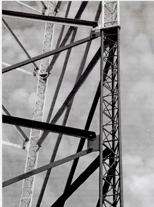
FIGURE 1. Example of a multi-level ("fractal") truss system, where each of the beams of the truss structure is itself a truss

The improvement in performance is primarily due to lower air density. By starting at a lower atmospheric pressure, the vehicle has several design advantages that result in a reduced delta-V required to reach orbit. As well as the reduced drag, the aerodynamic advantages include: