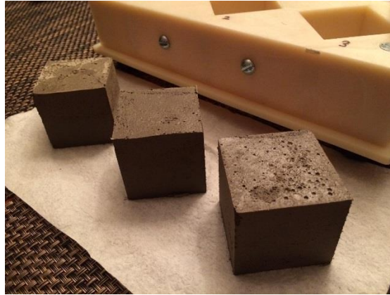
Figure 3 – Concrete Cubes made with Mars-1A Aggregate and MgO/MKP Cement

Full characterization of various concretes will include measurement of compression strength, tensile strength, flexural strength, thermal shock, vacuum stability, and hypervelocity impact testing.