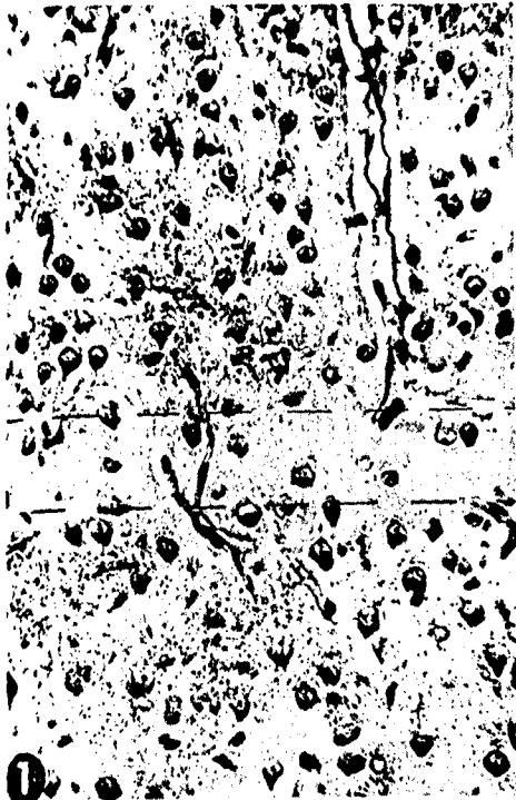
FIG. 1.—Abundant glycogen granules are visible on both sides of the 'Bragg peak band'. The 'Bragg peak band' (outlined by the interrupted lines) is located in the middle layers of the cerebral cortex. (39 hr after irradiation. PAS stain, counterstained with haematoxylin) \times 240 .